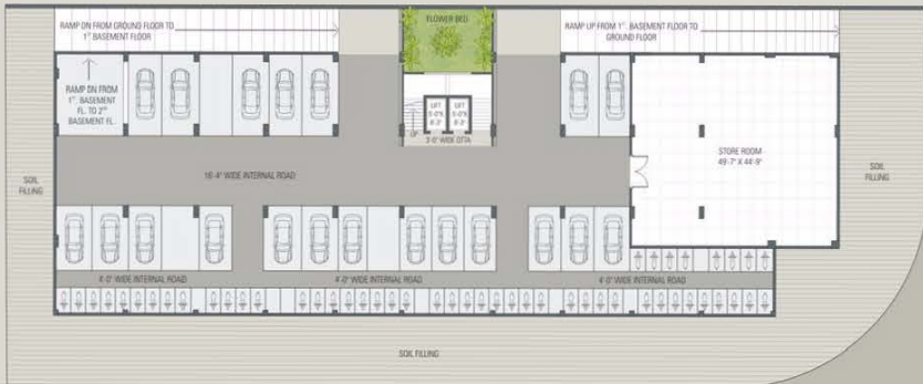
First Basement Parking